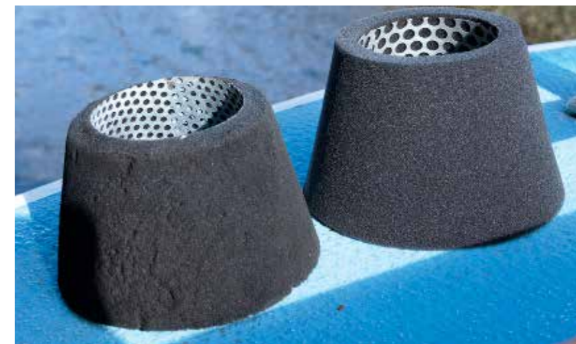
ABOVE The old air filter (left) next to the new filter (right). This may explain the silicon in the oil analysis, as the filter appears not to have been changed for many years

detecting problems, not absolute values.